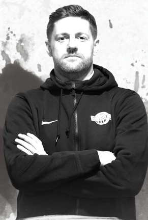
Jock Sutherland ASSISTANT COACH