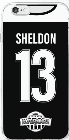
PERSONALISED BACK OF SHIRT