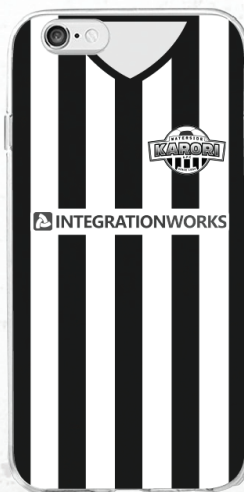
WATERSIDE KARORI HOME STRIP

Available on all iPhone and selected Samsung models